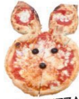
KIDS PIZZA MARGHERITA £5.00